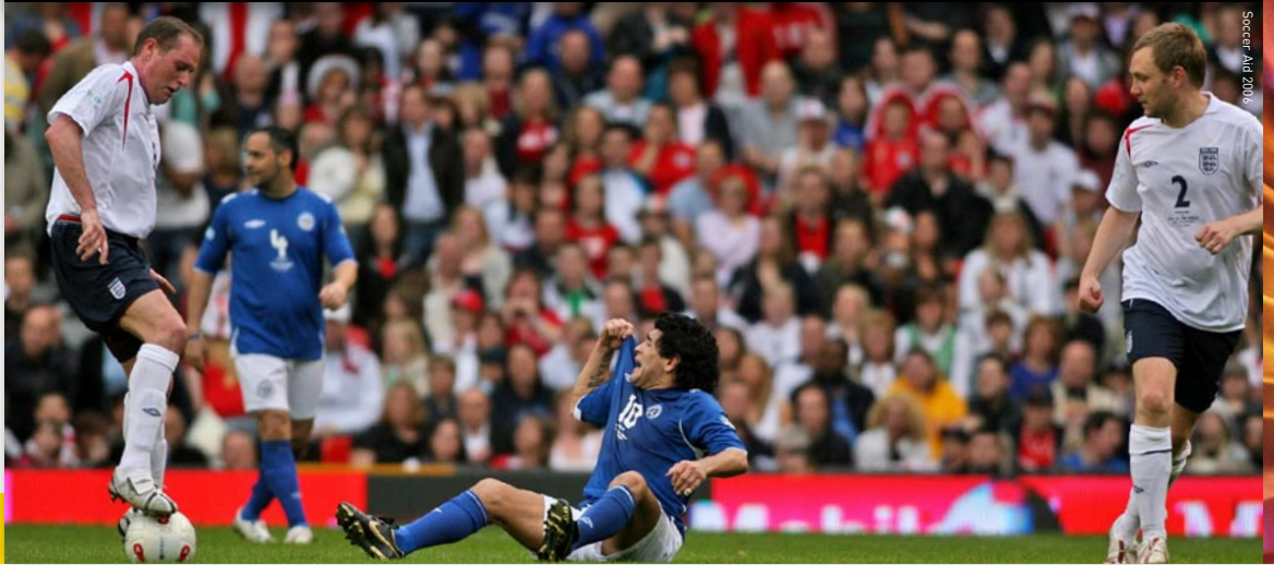
Soccer Aid 2008