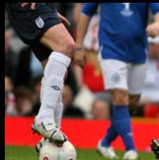
SOCCER AID 2008