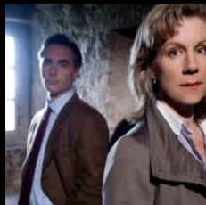
PLACE OF EXECUTION