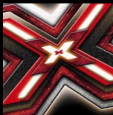
THE X FACTOR