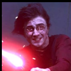
HARRY POTTER AND THE GOBLET OF FIRE