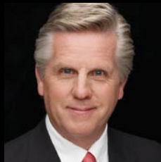
UEFA CHAMPIONS LEAGUE