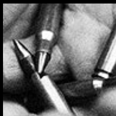
IN THE LINE OF FIRE