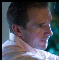
THE CONSTANT GARDENER