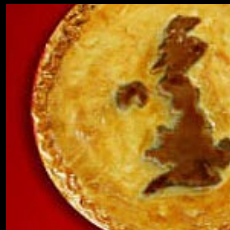
BRITAIN'S BEST DISH