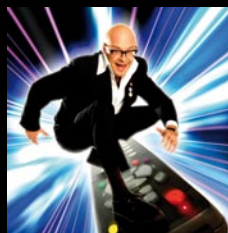
HARRY HILL'S TV BURP